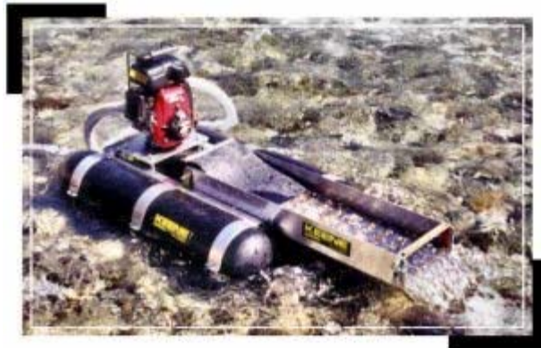
"This picture is a sample"

Get your money to Warren, "The Raffle Guy!"